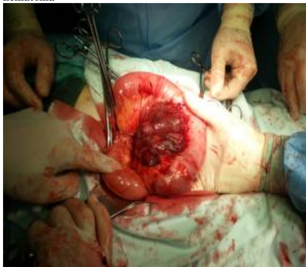
Figure no. 3. The intraoperative aspect of the mesenteric hematoma

The histologic examination of the resected segment of jejunum demonstrated the existence of a massive hematoma in the intestinal wall (figure no. 4).