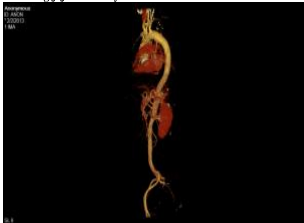
Figure no. 2. CT scan, 3D reconstruction, highlighting the offending jejunal artery and mesenteric hematoma

CT scan also reveals the presence of the blood in peritoneal cavity. Venous phase of the leak source on the CT scan exploration demonstrated the same density as in aortic lumen that was highly suggestive sign of arterial source of leak. No other vascular malformation or pseudo cyst complicating acute pancreatitis was noted. At this particular moment, taking into consideration the unstable vital signs, the decision to undergo to emergency surgery was made. Median laparotomy was performed and a large mesenteric hematoma caused by jejunal artery rupture was found and a large volume of blood was removed from the peritoneal cavity (more than 2000 milliliters) (figure no. 3)